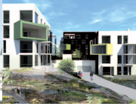
NCC Optiplan Oy