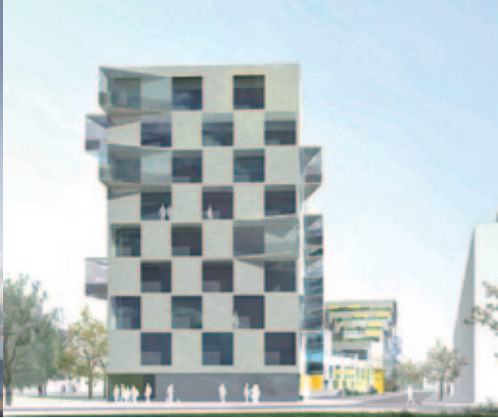
Playa Arkkitehdit Oy