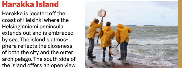
The Baltic Sea crashes against the shores.

Harakka is a former military island of the Finnish Defence Forces, and it was opened to the public in 1989. The buildings on the island date back to when Finland was ruled by Russia, and some are from the time when the island was occupied by the Finnish Defence Forces. The island's current nature house was originally a Russian barracks building built in 1908.